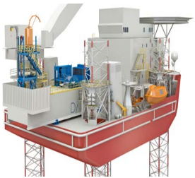
LIGHT WELL INTERVENTION CANTILEVER