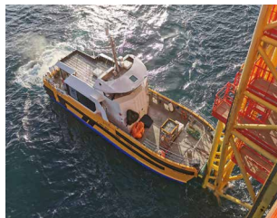
TRANSFER TOWER/ BOATLANDING PLATFORM